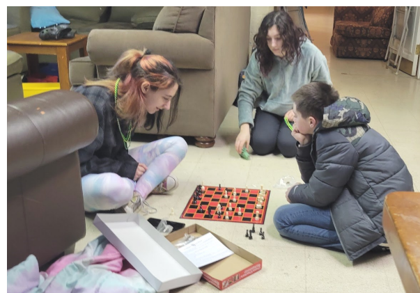
Youth group fun