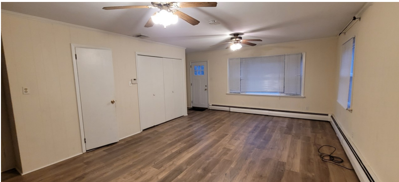
Photos of the parsonage.

Stay tuned, as we move into Spring, the Trustees will be planning an outside cleanup day to keep our property welcoming to our members and the community.