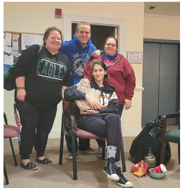
Some of our many Wednesday leaders