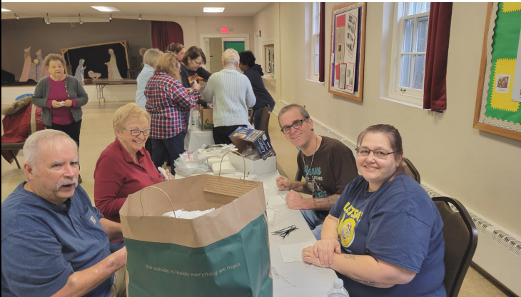
Utensil wrapping at a previous mission project.

Trenton Area Soup Kitchen serves over 8,000 meals a week to those in need, no one is turned away. So to help them with this incredible task, YUMC will have a utensil wrapping event on April 23 following the church service. Come get your coffee, snack, and find a seat and join others as we wrap utensils and share fellowship together.